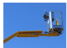
Fly jib (option)